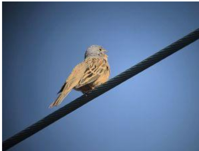
Cretzschmar's Bunting taken this morning near Charamida

A female Marsh Harrier circled in the distance and another Black Stork dropped in. A large group of birders were watching a Great Bittern , so we joined them and filled our boots, what a cracker, (apparently later on a second bird was reported there).