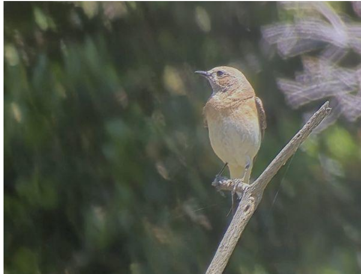
Black-eared Wheatear (female)

We left the area around 4pm and drove back to Skala Kalloni, we re-visited the Bush Robin site, but the wind had come up and we saw very little, just lots of European Bee-eaters , Corn Buntings and Crested Larks . We finished for the day around 5:30pm.