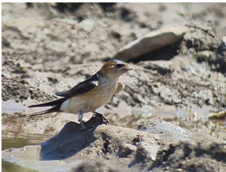
Red-rumped Swallow collecting mud

A quick stop up the hill from the Band-Stand produced a lovely Toothed Orchid and further along the main road we stopped to look for Middle-spotted Woodpecker . We saw two, a pair, they were returning to the same cluster of trees, but we could not locate a current nest hole.