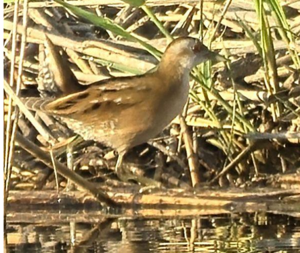
Female Little Crake

at this time of the year, Little Crake , Little Bittern , Squacco and Purple Heron . Ruddy Shelducks with a large number of chicks was a surprise.