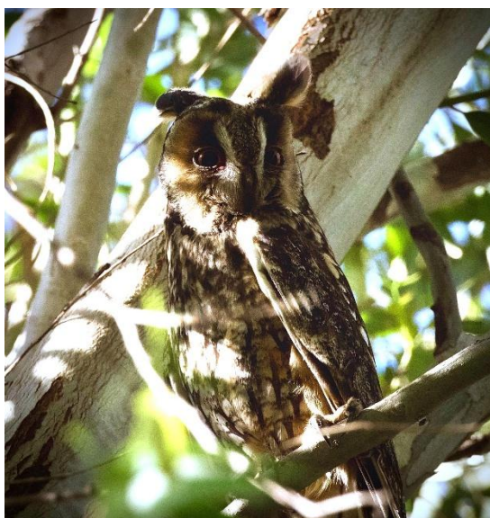
Long-eared Owl

We ate our lunch at the outflow near the racetrack behind Alykes Wetland. We found a Whimbrel and a Kentish Plover on the beach and two Whiskered Terns flew along the shore.